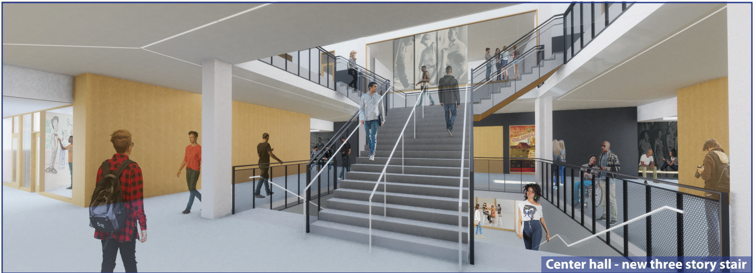
Center hall - new three story stair

A $158 million investment in Northeast Portland