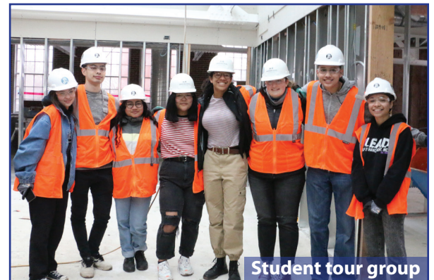
Student tour group

The Grant campus will remain an active construction site through most of the summer. This means that many summer sport activities will remain at Marshall or take place at other sites. Please consult with your coaches to determine where you will practice this summer.