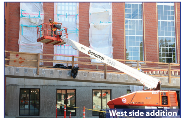
West side addition