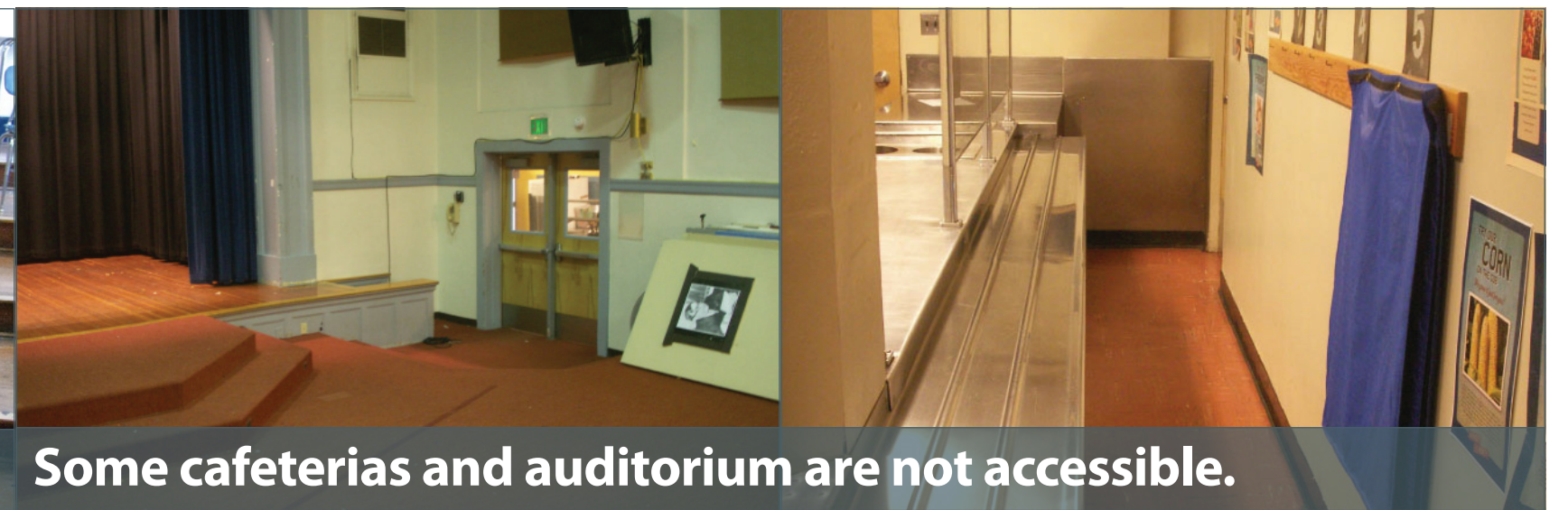
Some cafeterias and auditorium are not accessible.