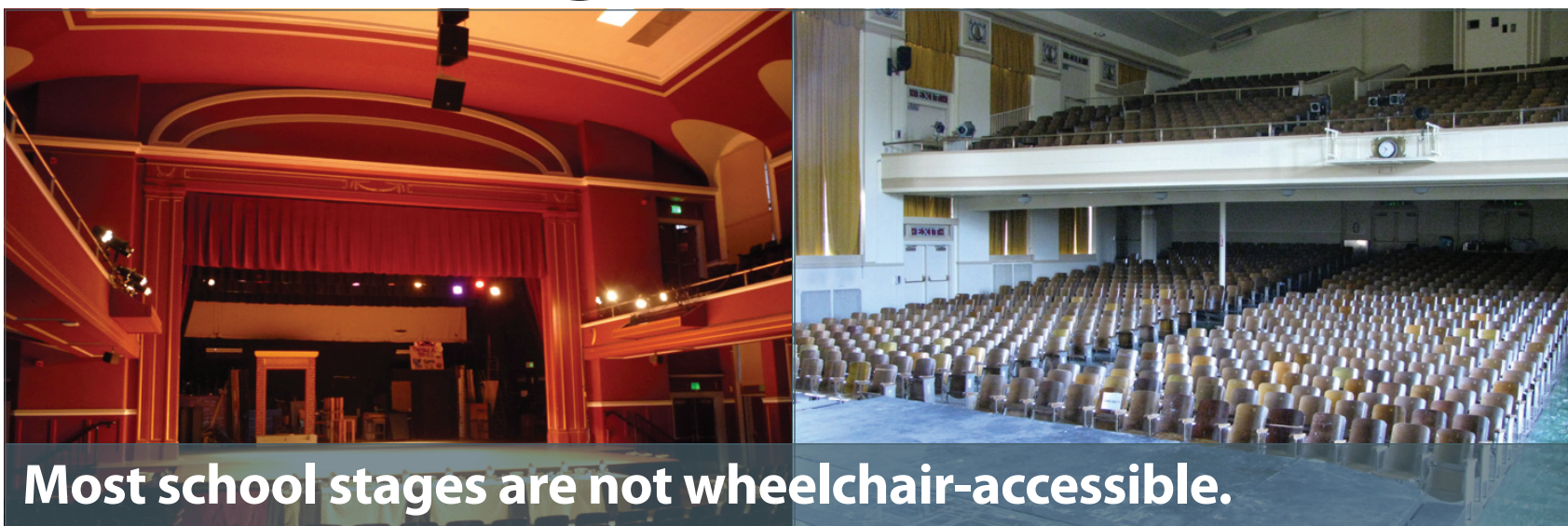
Most school stages are not wheelchair-accessible.