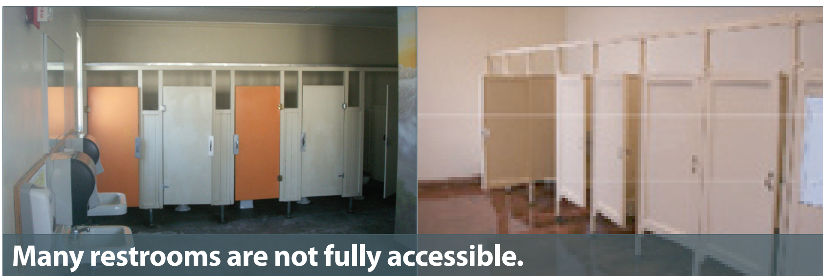
Many restrooms are not fully accessible.