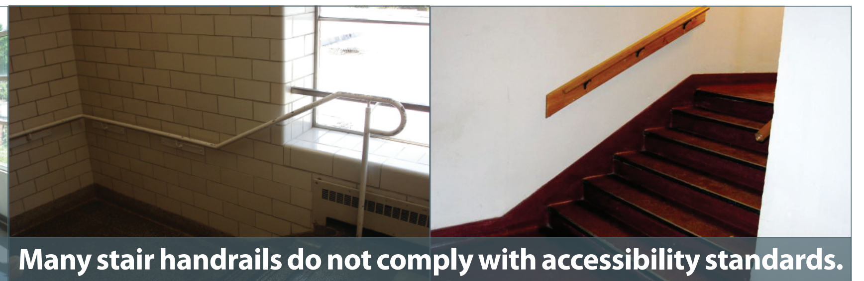
Many stair handrails do not comply with accessibility standards.