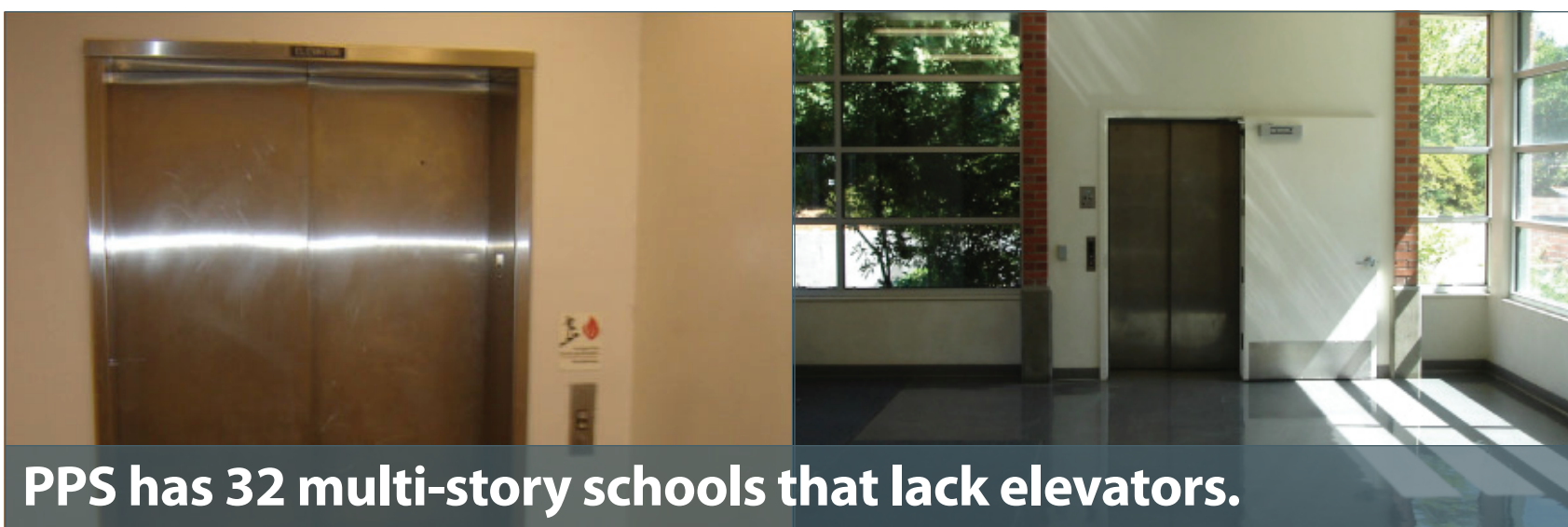
PPS has 32 multi-story schools that lack elevators.