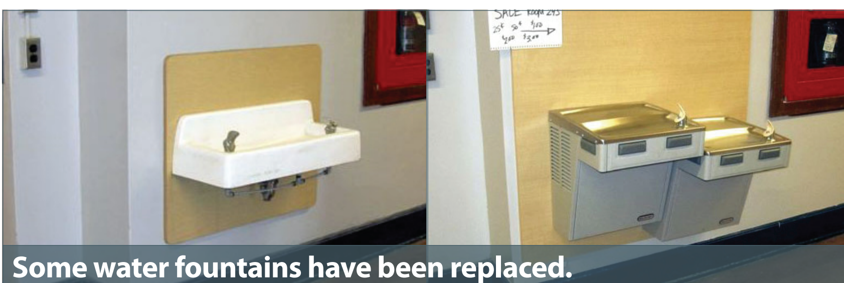
Some water fountains have been replaced.