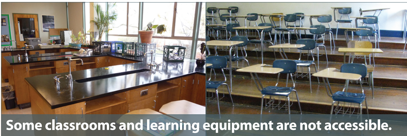
Some classrooms and learning equipment are not accessible.