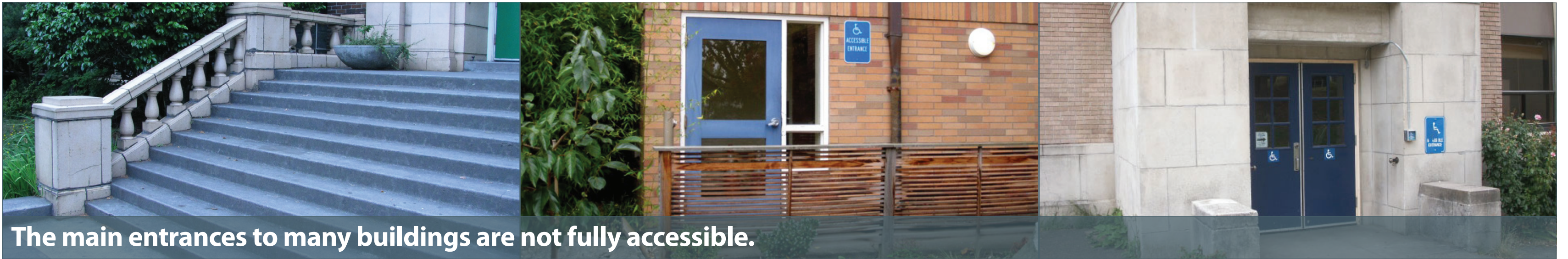
The main entrances to many buildings are not fully accessible.