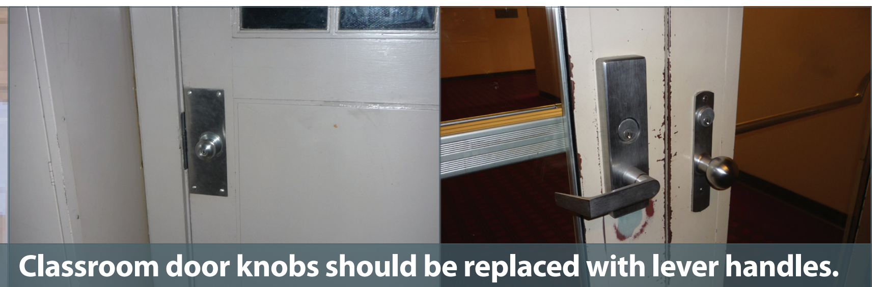
Classroom door knobs should be replaced with lever handles.